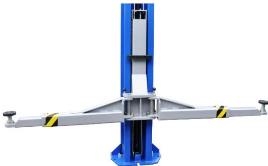
HD Symmetric Swing Arms with 'Automatic' Arm Restraints