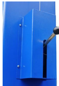
Single Point 'Cable' Lock Release