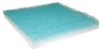
Premium Exhaust Filters