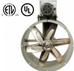
High Quality 24" Tube-Axial Exhaust Fan w/ Spark Resistant Blades