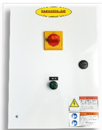
Deluxe Control Panel Included